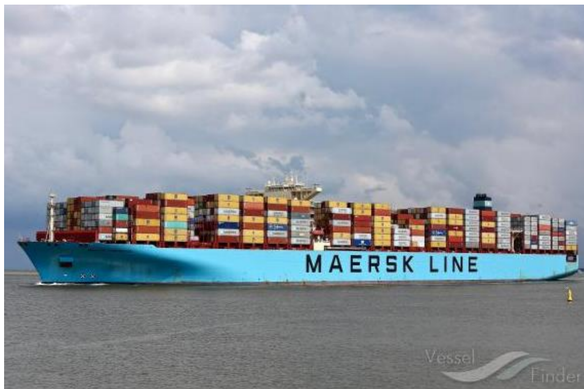
Maersk Edmonton

Gemini Cooperation, Premier Alliance and MSC have all unveiled their 2025 service networks. Ocean Alliance has yet to announce its network, but given the stability in its alliance structure, only minor changes are expected.